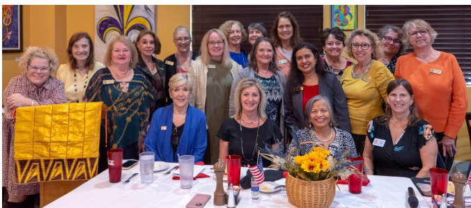
Zonta Club of Lafayette Members