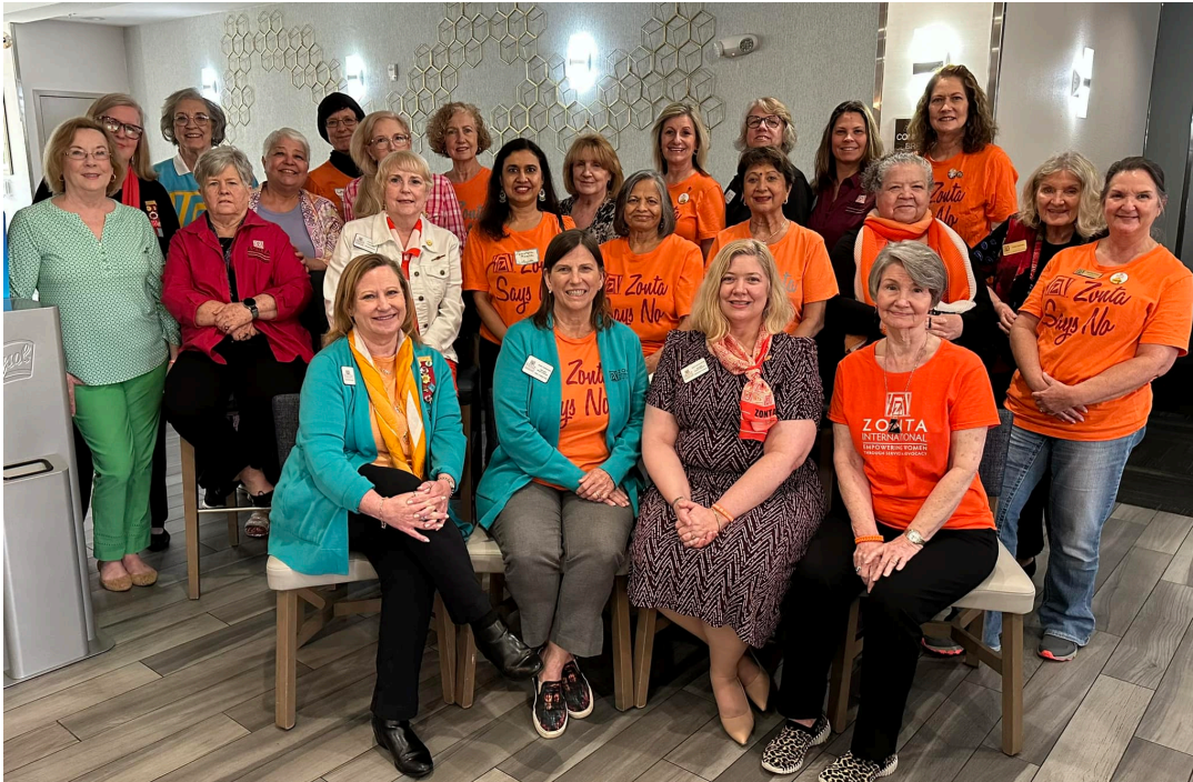
Zonta Club Area 2 Participants

A very educational Zonta District 10 Area 2 Workshop was hosted by Zonta Club of Lafayette Louisiana to learn more ways to Build a Better World for Women and Girls.